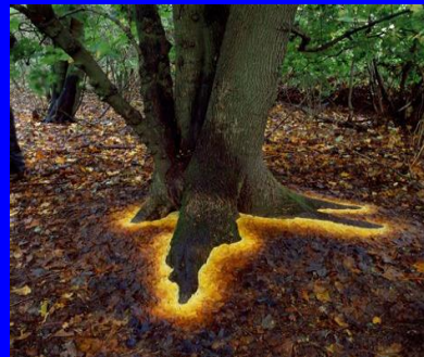
Original Andy Goldsworthy